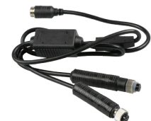
Standard Definition Splitter Cable (If Needed)