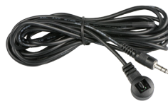
External IR Sensor