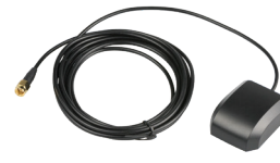
External GPS Receiver