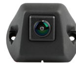
Ultra-wide 1080p Camera with Housing (4-6)