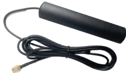
External Wi-Fi Antenna