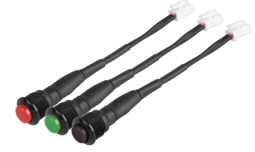
Push Button Screen View Controls

www.fireresearch.com +631.724.8888 sales@fireresearch.com