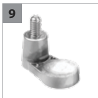
9 WNT Wingnut Terminal