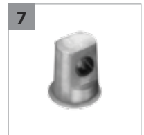
7 UT Universal Terminal