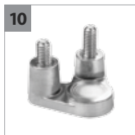
10 DWNT Dual Wingnut Terminal