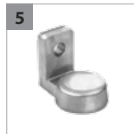
5 LT L-Terminal