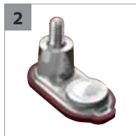
2 EHPT Embedded High Profile Terminal