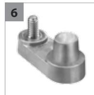
6 DT Automotive Post & Stud Terminal