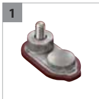
1 ELPT Embedded Low Profile Terminal