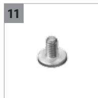
11 ST Stud Terminal