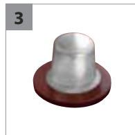
3 EAPT Embedded Automotive Post Terminal