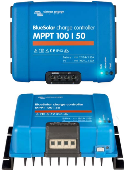
Solar Charge Controller MPPT 100/50