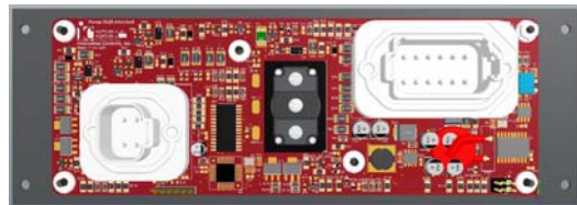
DT15-4P ROAD / PUMP Solenoids