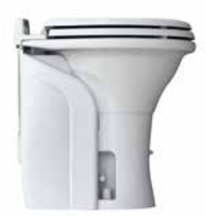
MF 7640 toilet - profile

Refer to ANSI 1192 and Z240 RV Series standards, where applicable, for additional RV toilet installation guidelines. Specifications subject to change.