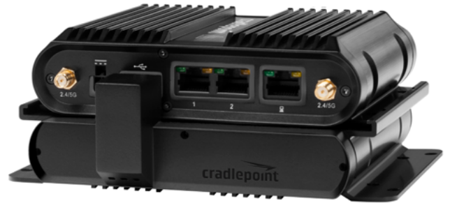
COR IBR1100 with option dual-modem dock

Dual-modem: Cradlepoint's optional dual-modem dock for the COR IBR1100 series provides flexibility in deployment with additional bandwidth or failover capability across multiple carriers. Wireless-to-wireless failover ensures mission-critical applications stay online when you need them most. A second modem can also be used to augment bandwidth for applications like passenger WiFi, video, or cloud access to ensure an ideal quality of experience.