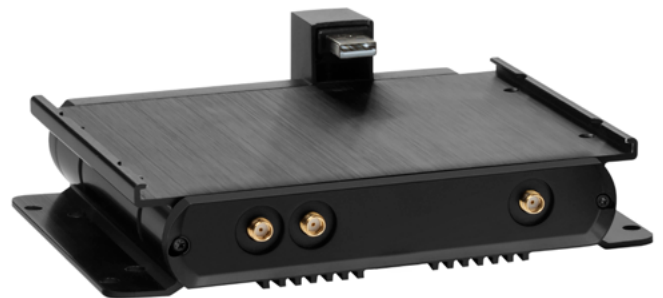
Option dual-modem dock

LEARN MORE AT CRADLEPOINT.COM/IN-VEHICLE