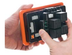
Snap on RelayPak